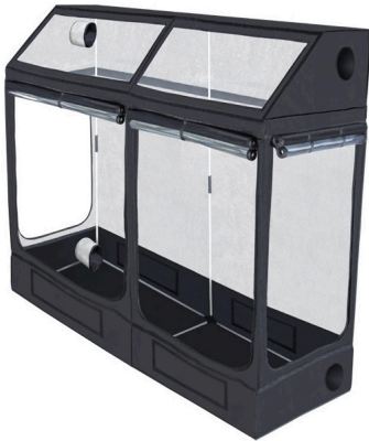
Probox Outdoorpro 240L 240x120x220cm